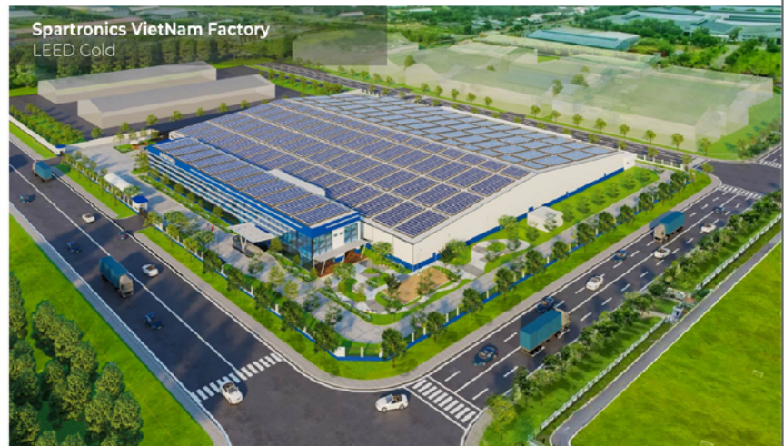
Spartronics VietNam Factory LEED Gold