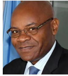
Rémi Nono Womdim Representative of the Food and Agriculture Organization of the United Nations (FAO) in Viet Nam